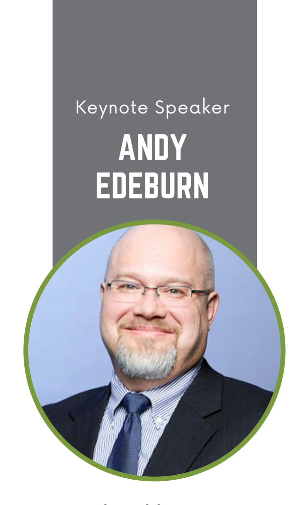
Founder, Elder Dynamics Healthcare advisor and thoughtleader across post-acute, elder care and the community continuum